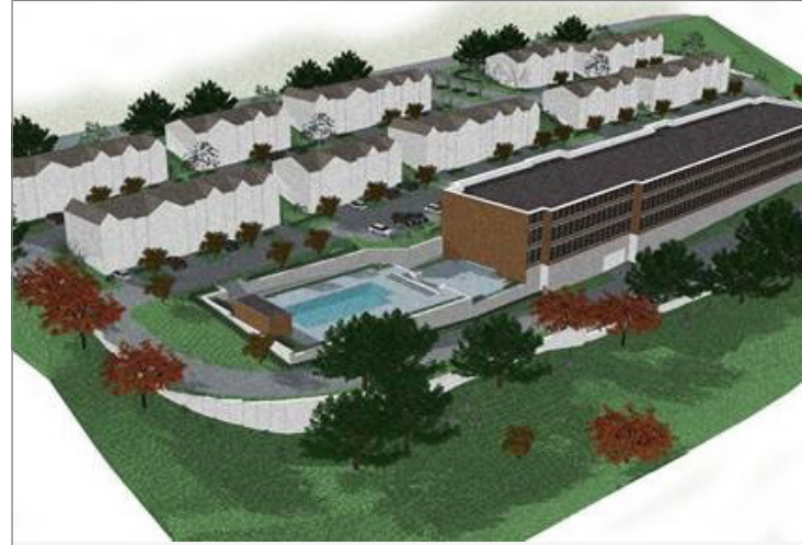
Concept, sketch and detailed design

KeySCAPE relies on a single source of the truth. Its extensive features inside one AutoCAD package mean there is no need to keep switching between multiple applications or maintain several copies of files in different locations, just create and edit once. This reduces the risk of error, saves you time and aids smooth collaboration on projects. The flexibility of KeySCAPE allows you to customise the system so workflows can be streamlined. Compliance to industry standards means more time can be spent designing and less time ensuring conformance.