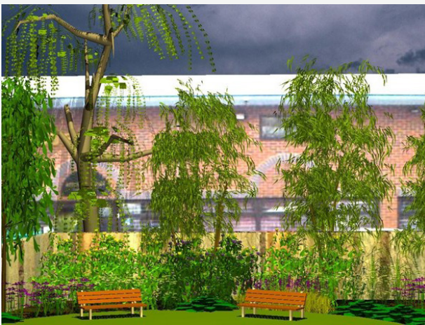
3D Visualisation tools